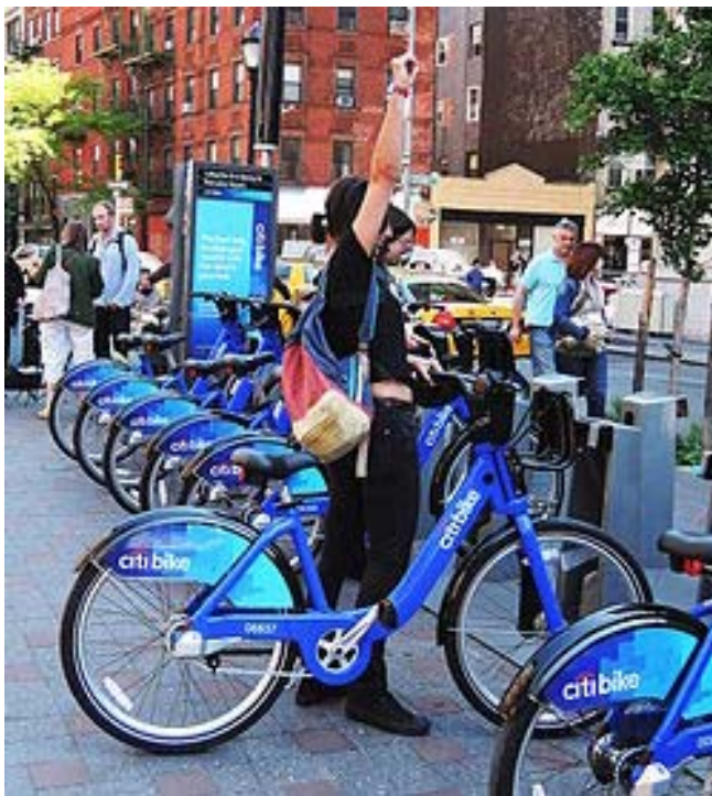
Figure 1 The Citi Bike bikes in NYC.

Bike travel is often considered a healthy and environmentally friendly mode of travel and promoted by cities. While it is of no debate that bike travel is good for the environment, bike accidents and exposure to toxic air pollutants also negatively affect bikers' physical wellbeing. The net health benefits of bike travel are therefore not clear cut, and are worthy of study case by case. Our research at UCD studies an example of a bike-sharing program in New York City (NYC) called Citi Bike, and finds that the implementation of Citi Bike produces an enormous health benefit for NYC citizens. As a result of this study, procedures were developed to integrate and analyze transportation and health data, and a manual on how to implement these procedures and how to use the transportation health assessment program ITHIM for similar studies is being prepared. Conventional transportation planning does not pay enough attention to the health aspects of transportation, partly because of a lack of ready-to-use tools for health impact assessment. This manual can serve as a useful guide for transportation planners and policy makers who want to assess how their policies affect public health.