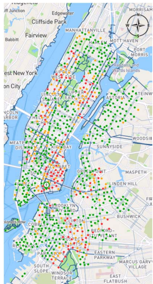
Figure 2 Citi Bike station locations (green, red, and yellow dots) in New York City.