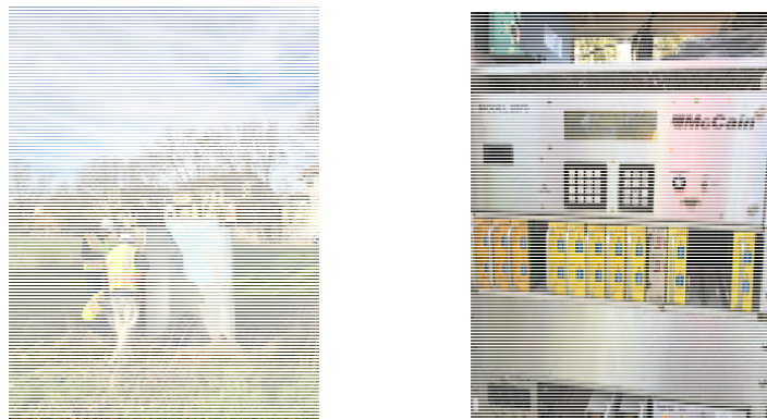
Figure 3 a). Students and Caltrans engineer downloading data from controller box (left). b). Detector rack inside the controller box (right).